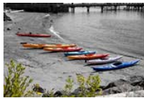
Kayaks on the beach at Fort Worden

Print version ( pdf format requires Adobe Acrobat Reader )