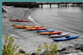
Kayaks on the beach at Fort Worden

Print version ( pdf format requires Adobe Acrobat Reader )